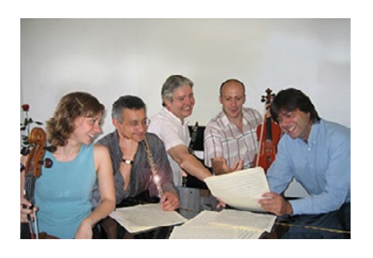
Saturday July 30th, 2016, 8.30 pm