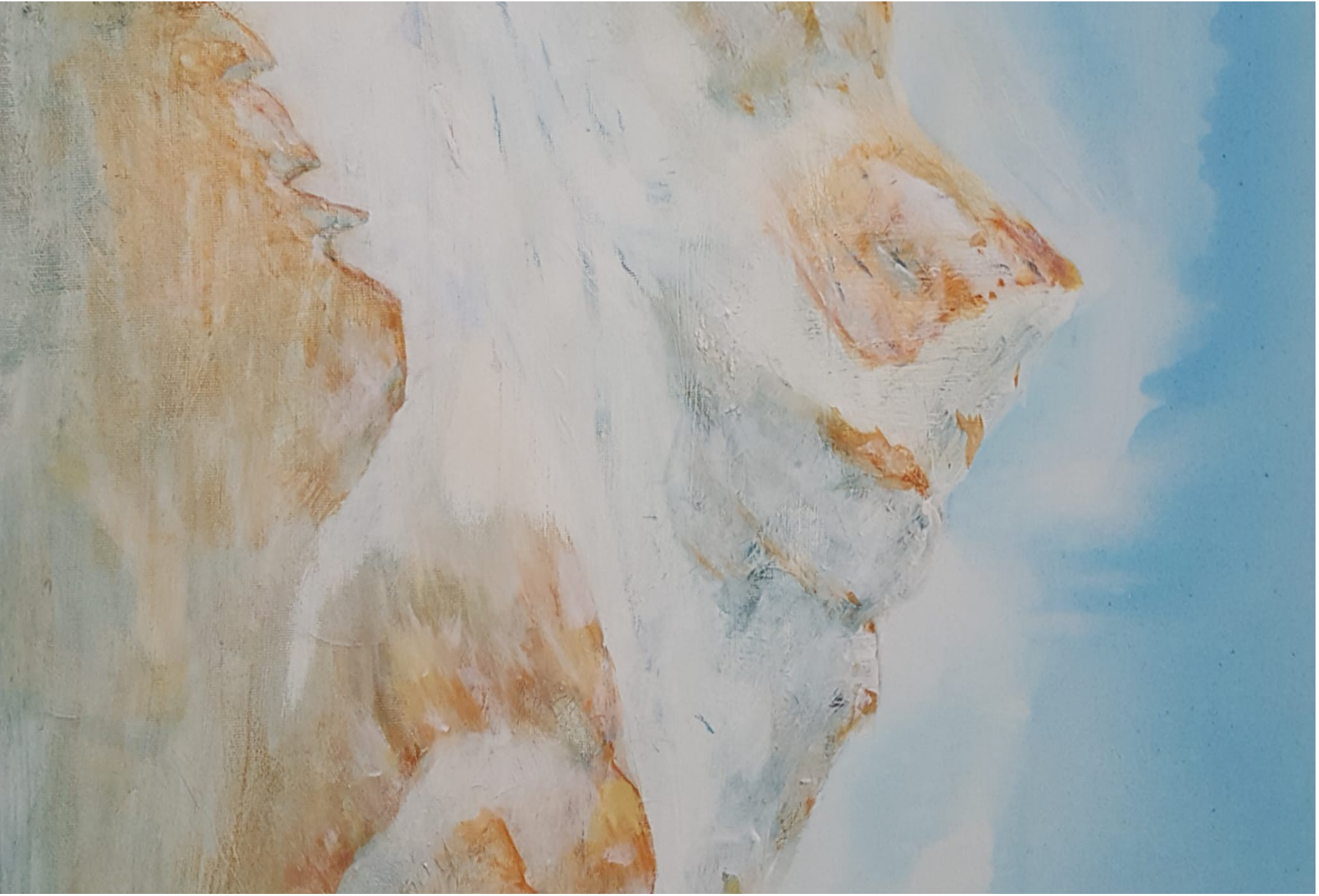
Aquarellbild 2021 von Sigfried Burgenet