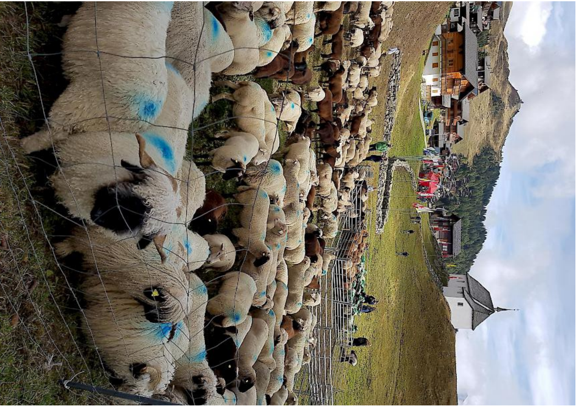
Foto: Schafscheid uf dr Bättneralp