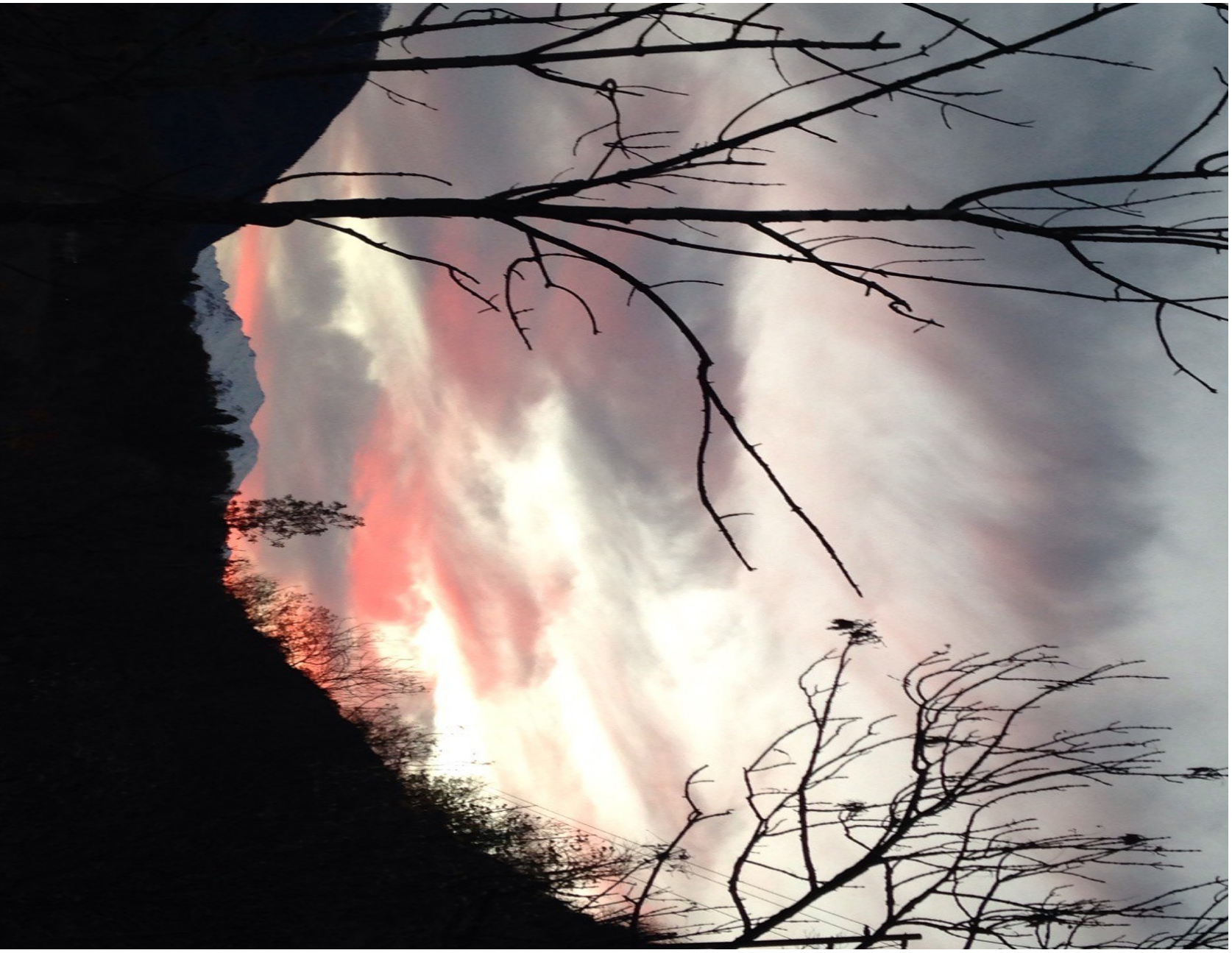
Foto: Abendrot in Birsch