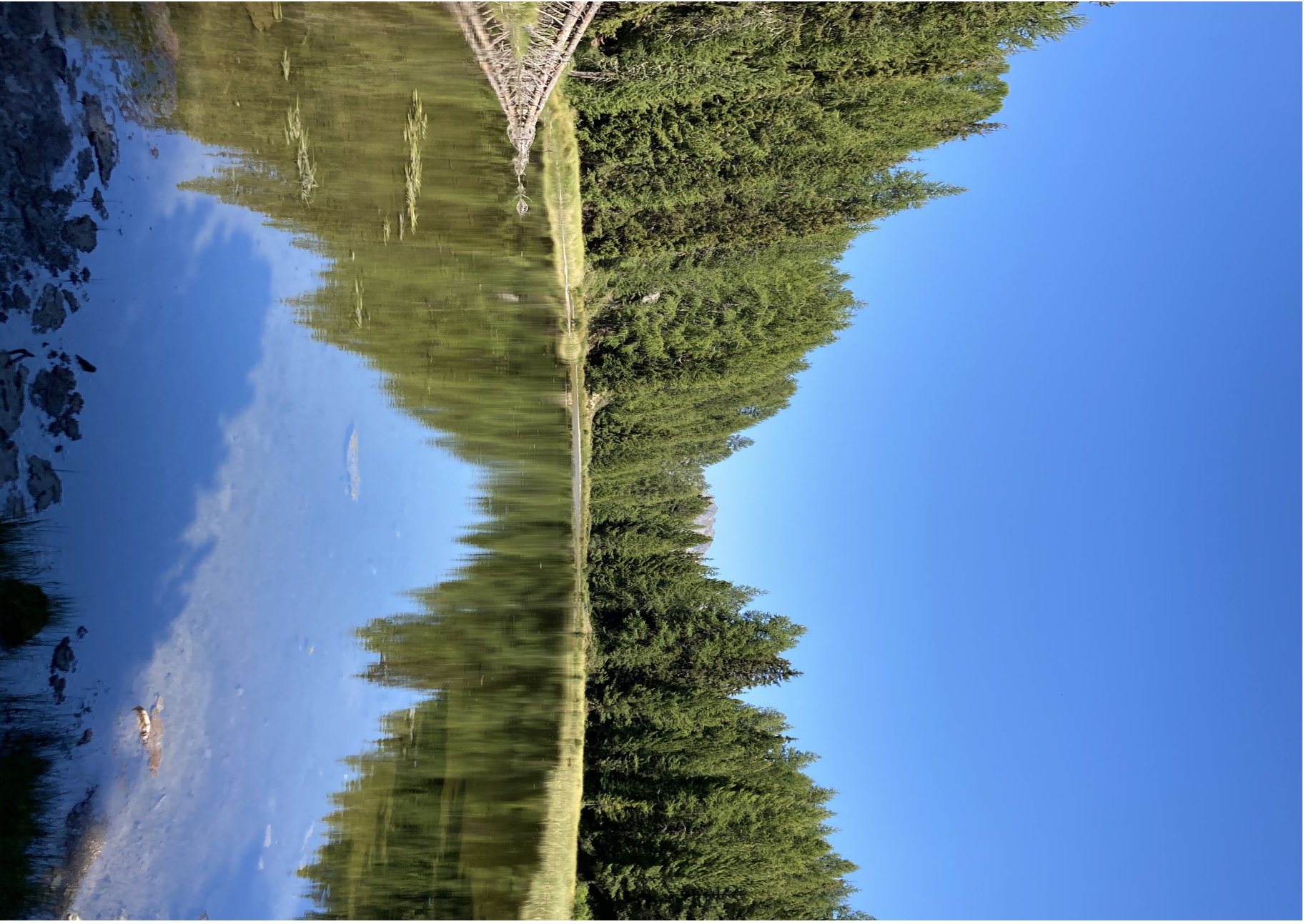
Foto: Breitmattensee in Törrbel